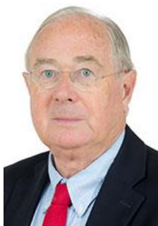
Mr Jean BIZET Head of Delegation President of the European Affairs Committee Group of the European People's Party (Christian Democrats) (EPP)