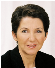
Ms Barbara Prammer

Group: Austrian Social Parliamentary Group Party: Austrian Social Democratic Party (SPÖ)