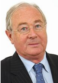
Chairperson European Affairs Committee

President of the Union for a Popular Movement group in the Senate