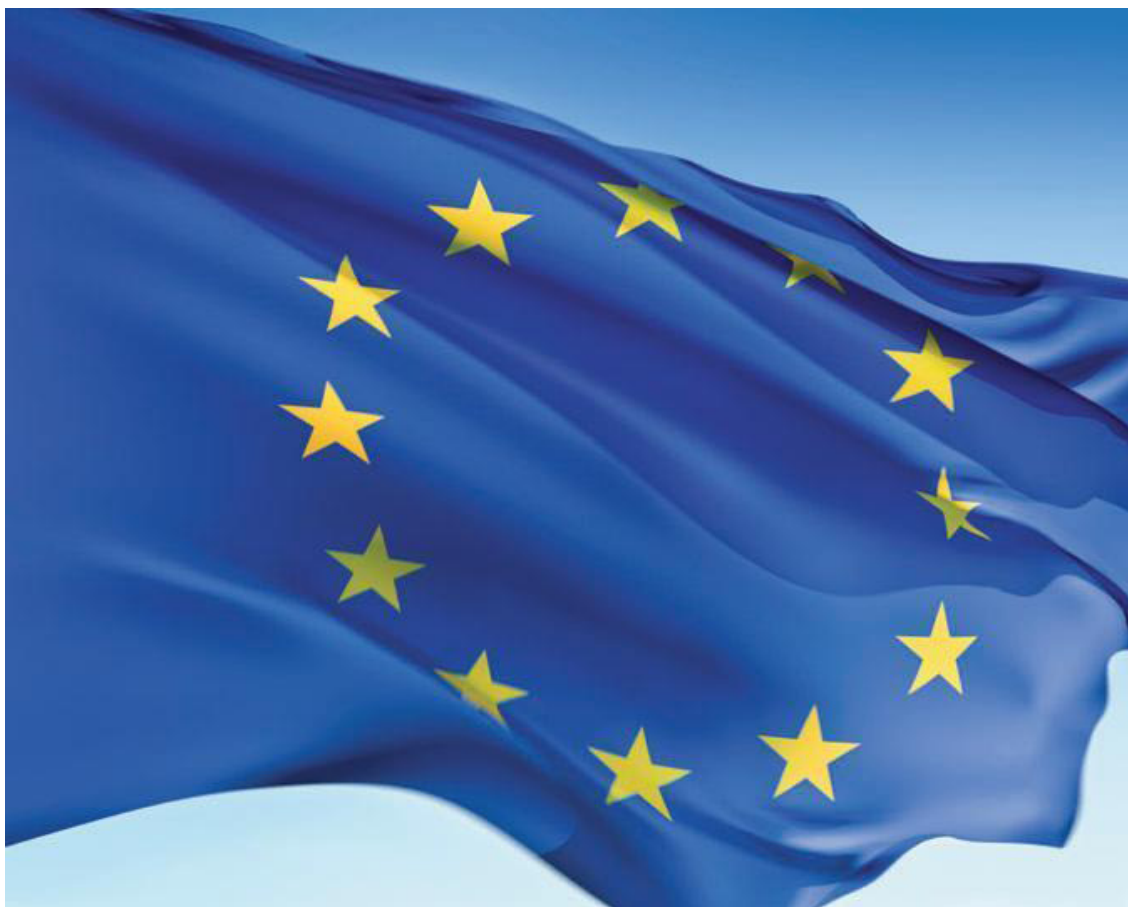
Photo Gallery of Heads of Delegation