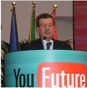
Mr Vannino Chiti