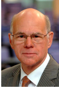
Mr Norbert Lammert

Member of the Christian Democratic Union (CDU) since 1966