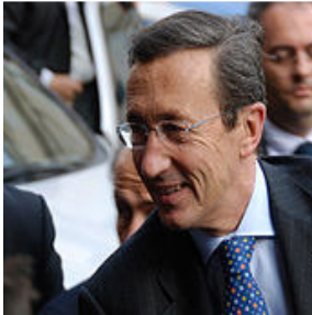
Mr Gianfranco Fini

Psychology degree Professional journalist