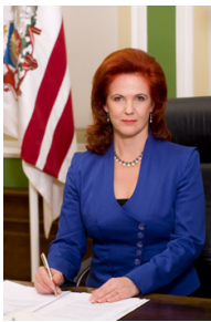
Ms Solvita Āboltiņa

Political affiliation: Alliance of Political parties Unity