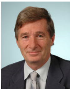
President of the Committee on European Affairs

Depuis 2007 : Président de l'Assemblée Nationale