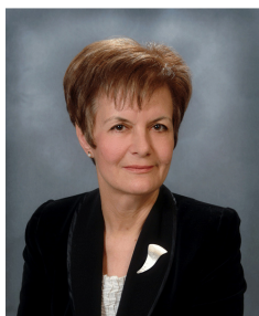
Chairwoman Standing Committee on Equal Opportunities for Men and Women