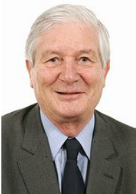
Chairperson Foreign Affairs Committee